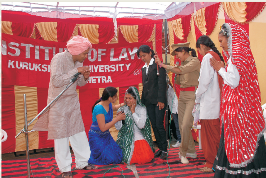
Students of the Institute are playing skit on the theme of 'Prohibition of Female Feticide' during Legal Literacy Camp held at Village Pratapgarh-Kurukshetra