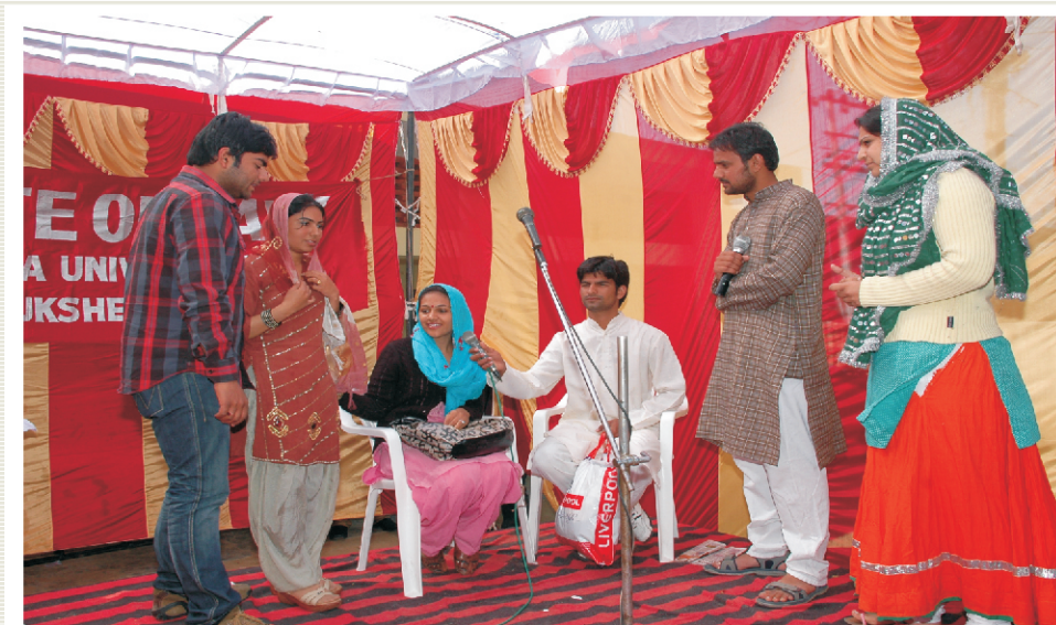
Students of the Institute are playing skit on the theme of 'Prohibition of Dowry and Domestic Violence' during Legal Literacy Camp held at Village Pratapgarh-Kurukshetra