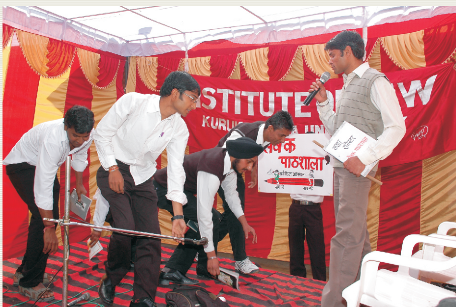
Students of the Institute are playing skit on the theme of 'Elimination of Corruption in Education' during Legal Literacy Camp held at Village Pratapgarh-Kurukshetra