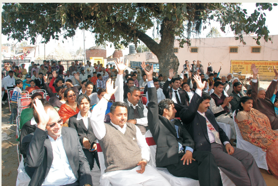
Villagers and Faculty members giving consent for Dowry Prohibition and Prohibition of Domestic Violence during Legal Literacy Camp held at Village Pratapgarh-Kurukshetra after the Skit