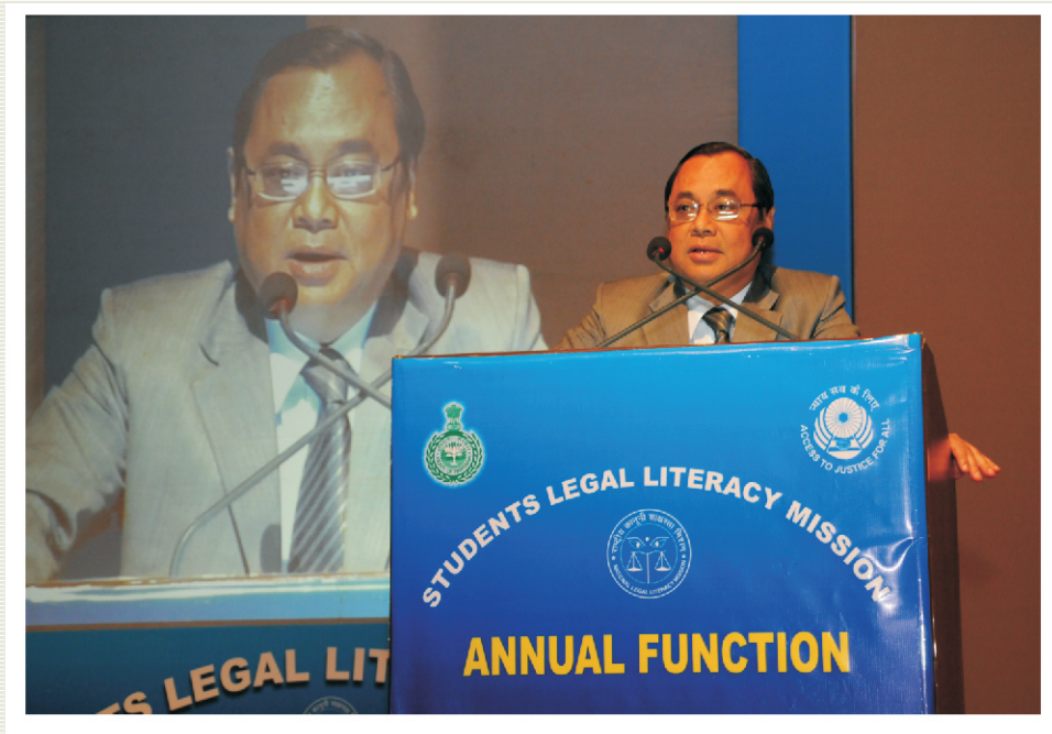
Hon'ble Mr. Justice Ranjan Gogoi, Chief Justice of Punjab & Haryana High Court addressing the students in the University Auditorium at Annual Function of Legal Literacy Mission