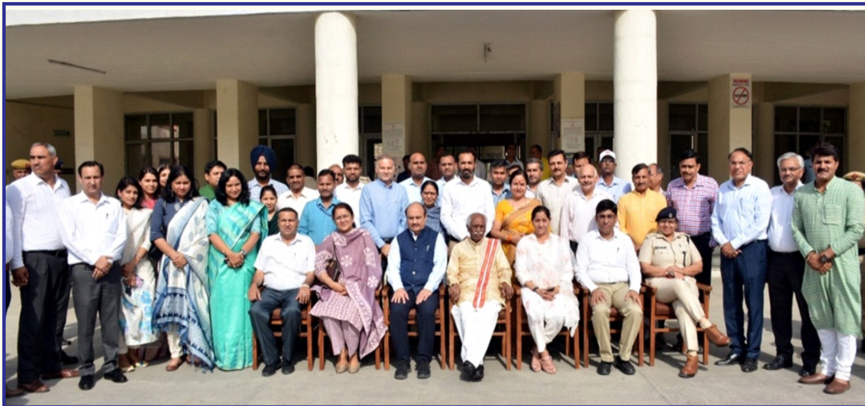
Hon'ble Governor of Haryana and Chancellor, Kurukshetra University Sh. Bhandaru Dattatreya with Faculty Members during his visit at Kurukshetra University, Kurukshetra