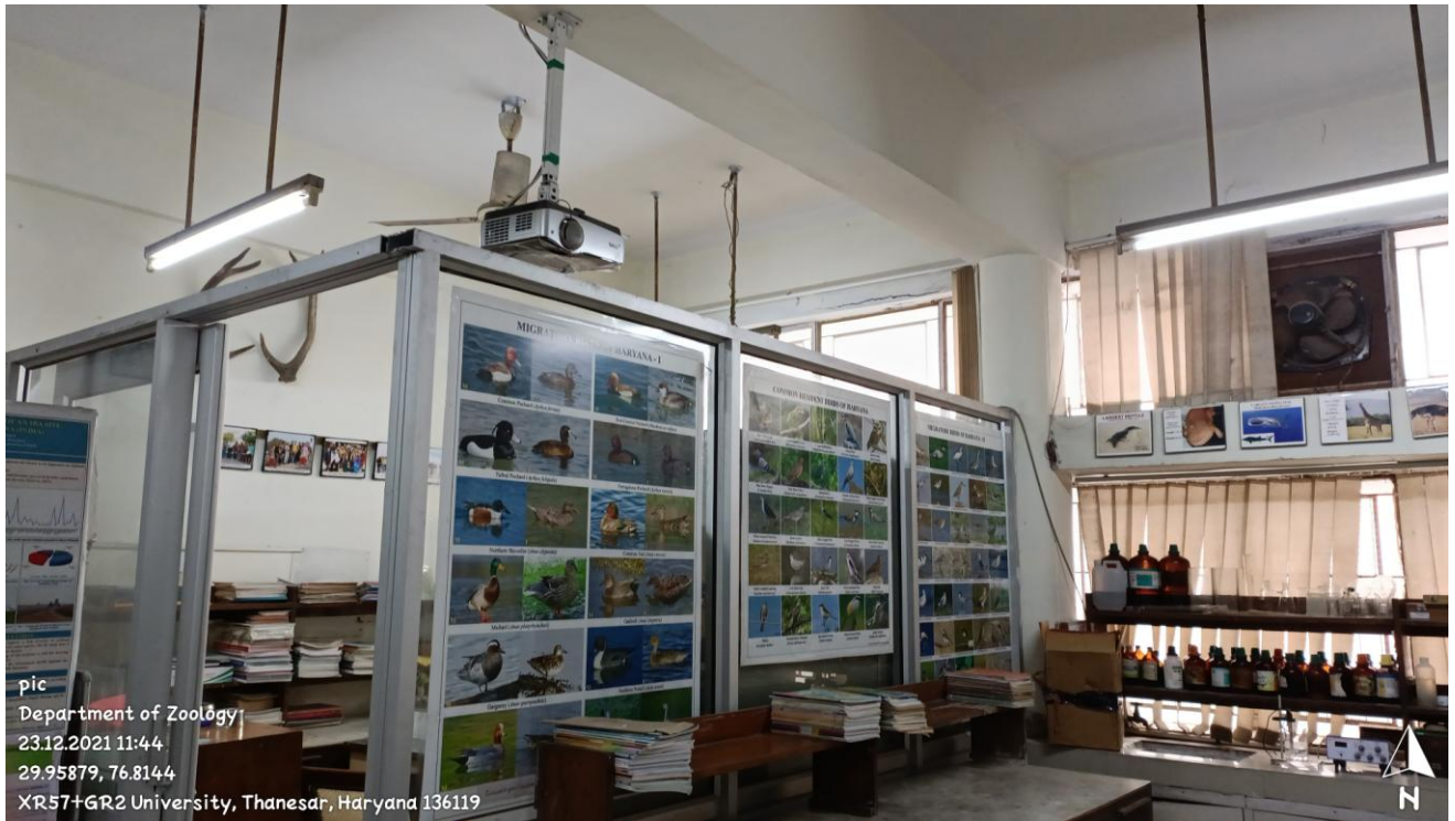
pic Department of Zoology 23.12.2021 11:44 29.95879, 76.8144 XR57+GR2 University, Thanesar, Haryana 136119