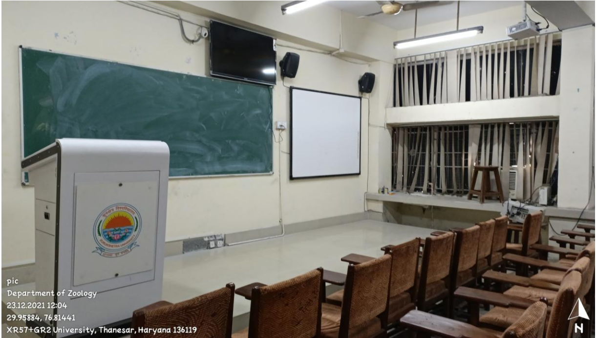
pic Department of Zoology 23.12.2021 12:04 29.95884, 76.81441 XR57+GR2 University, Thanesar, Haryana 136119