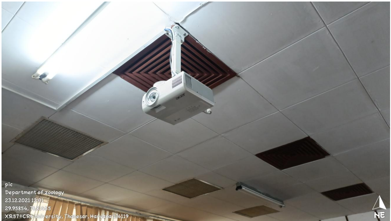
pic Department of zoology 23.12.2021 12:01 29.95854, 76.81455 XR57+CR6 University, Thanesar, Haryana 136119