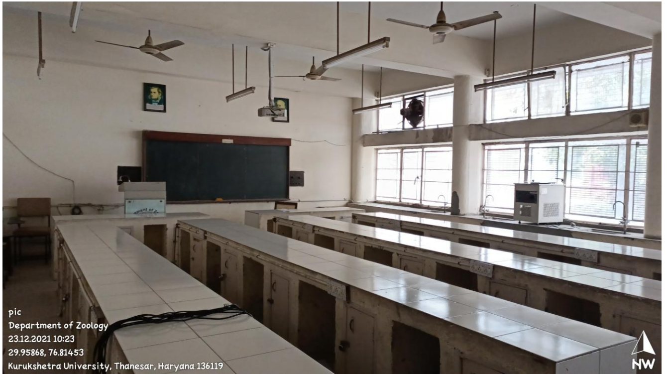
pic Department of Zoology 23.12.2021 10:23 29.95868, 76.81453 Kurukshetra University, Thanesar, Haryana 136119