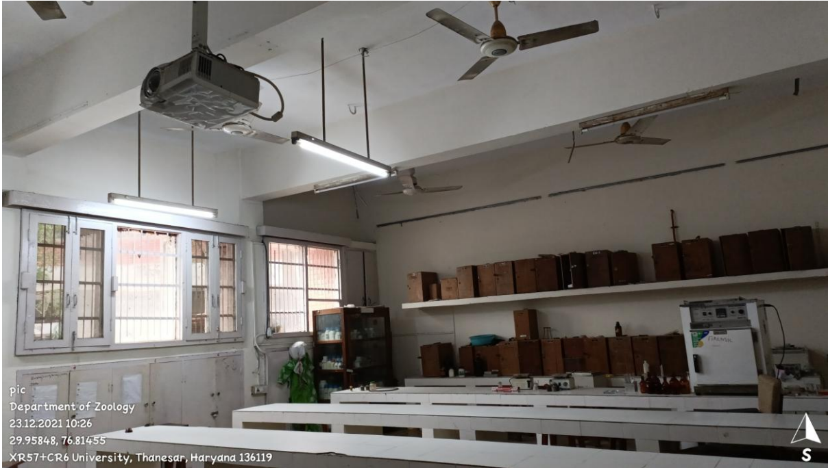
pic Department of Zoology 23.12.2021 10:26 29.95848, 76.81455 XR57+CR6 University, Thanesar, Haryana 136119