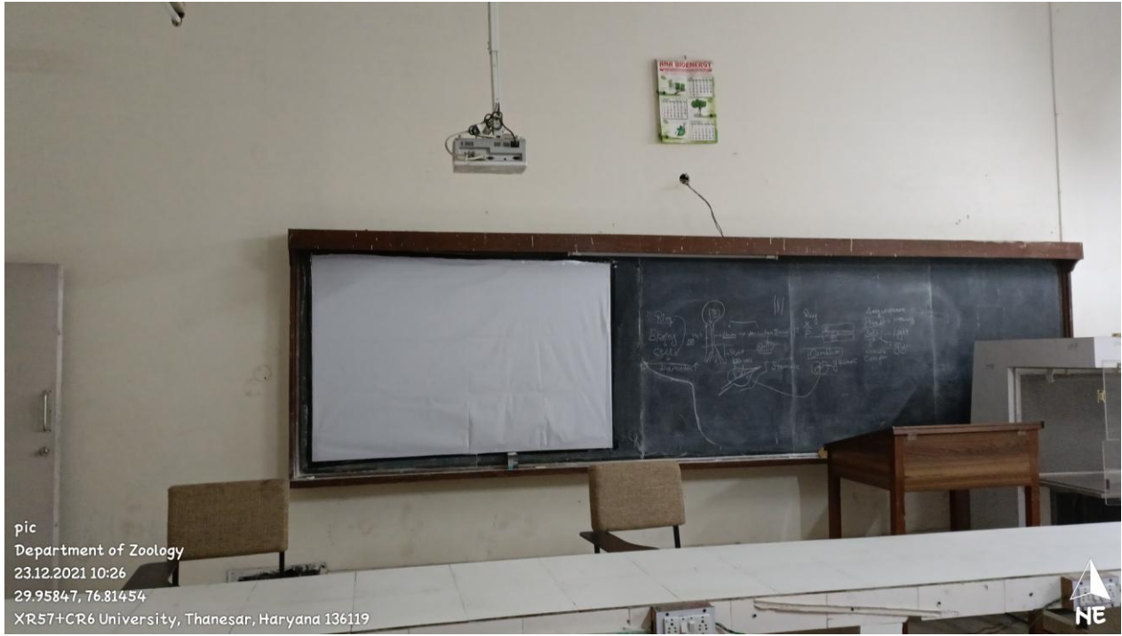
pic Department of Zoology 23.12.2021 10:26 29.95847, 76.81454 XR57+CR6 University, Thanesar, Haryana 136119