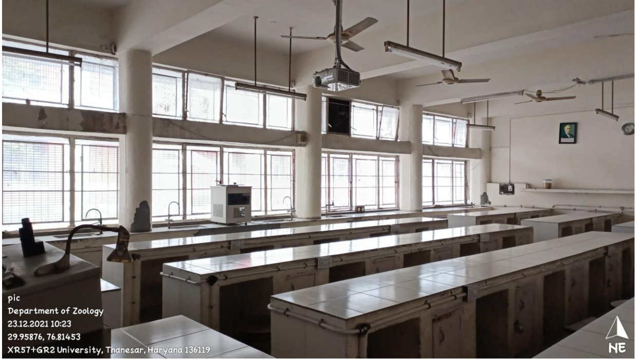
pic Department of Zoology 23.12.2021 10:23 29.95876, 76.81453 XR57+GR2 University, Thanesar, Haryana 136119